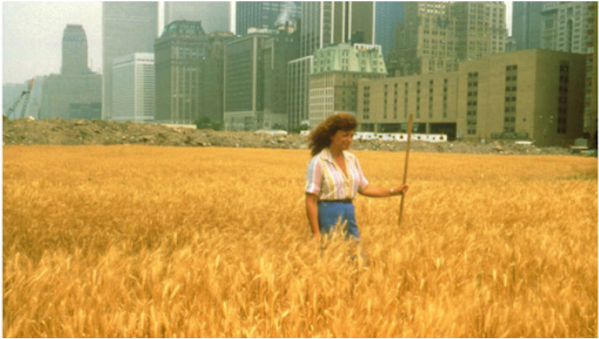
WHEATFIELD BY AGNES DENES

Agnes Denes planted a two-acre field of wheat on a landfill in Manhattan. This in and of itself was political; she grew life and food from forgotten trash, two blocks from Wall Street and the World Trade Center, looking out at the Statue of Liberty. She cared for the crop and was able to eventually produce 1000 pounds of healthy wheat.